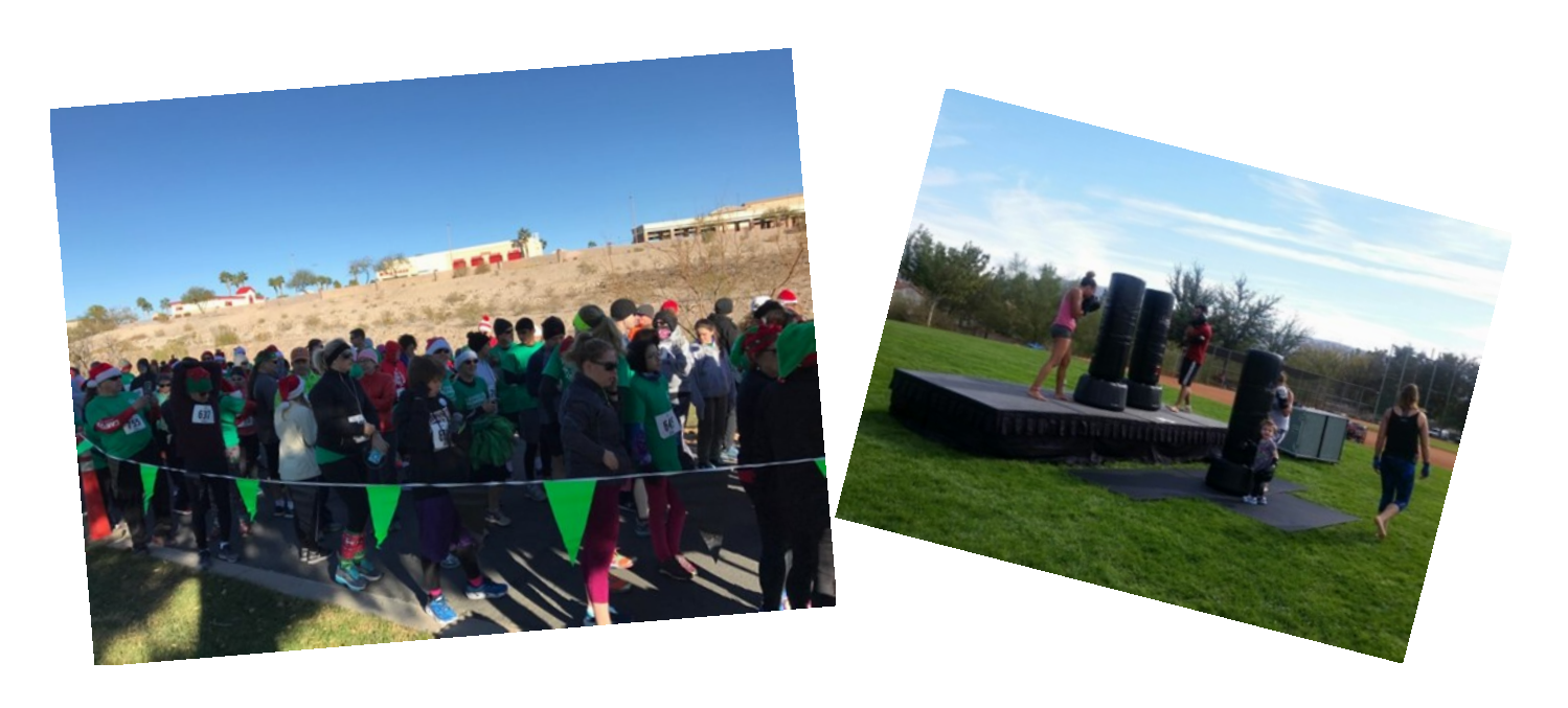
Staying active & fit in Henderson at community Jingle Bell 5K runs and Stroll & Roll events