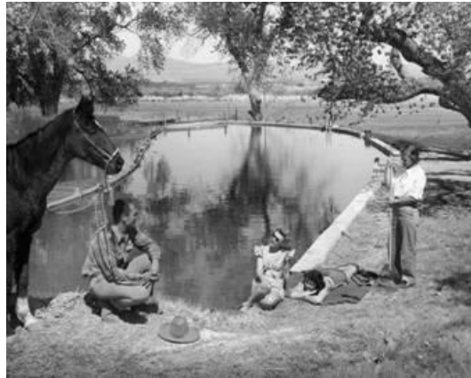
Kiel Ranch Historic Park, City of North Las Vegas

Please include a narrative summary of 600 words or less for the award banner and website submission.