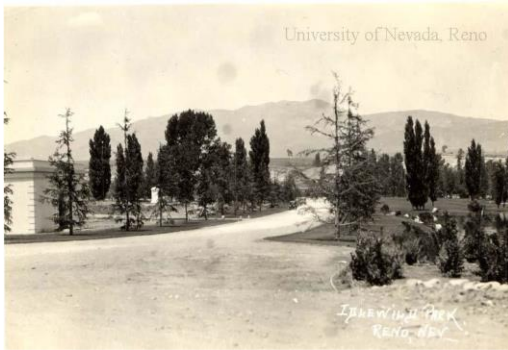
Idlewild Park, Reno, Nevada circa 1930

A Silver State Legacy Park is a park that holds special prominence in the local community and the state of Nevada. These parks have endured the test of time and have become iconic to those who have visited, played and rested on their grounds. Designation as a Silver State Legacy Park is the highest accolade the Nevada Recreation and Park Society can bestow upon a park.